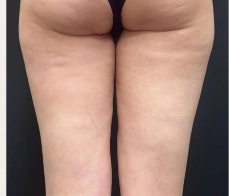
4.5 MONTH FOLLOW UP