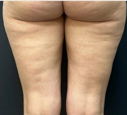
AFTER 10 LDM®