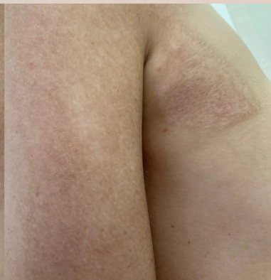
3 MONTH FOLLOW UP