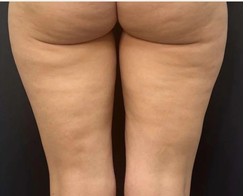
6.5 MONTH FOLLOW UP