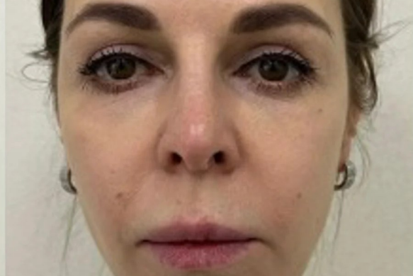
AFTER 10 LDM®