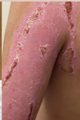
AFTER 4 THEN 9 LDM®