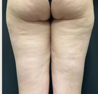
AFTER 10 LDM®